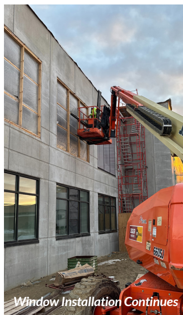
Window Installation Continues