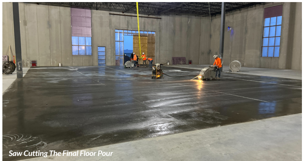
Saw Cutting The Final Floor Pour