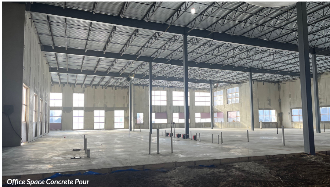
Office Space Concrete Pour

We sincerely appreciate your ongoing support throughout this process. Stay tuned for further updates, and thank you once again for your steadfast dedication to your cooperative. We look forward to celebrating the opening of our new space with all of you!